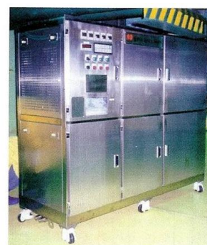
Main Degassing System