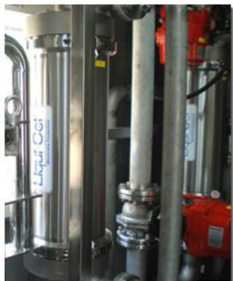
10-inch Stainless Steel Degassing System

Dissolved gas control in a nuclear power plant's water system, including the primary make-up water storage tank and refueling water storage tank, can be essential to reduce radiation source term (defined as a release of radioactive material). Controlling dissolved gases can also help reduce the formation of unwanted radionuclides, such as