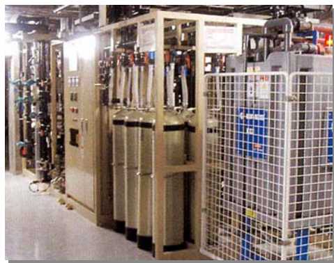
Water Treatment system using Liqui-Cel® Contactors at Tohoku University