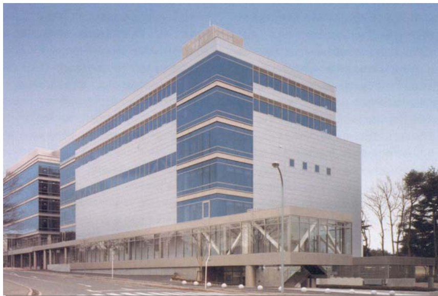
Tohoku University in Japan

This process requires high purity water with dissolved hydrogen gas. One key element in this process is controlling the amount of hydrogen gas that is dissolved into the water. Depending on the process, the amount of hydrogen gas dissolved into the water varies.