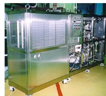
Contactors in use at Wolsung NPP