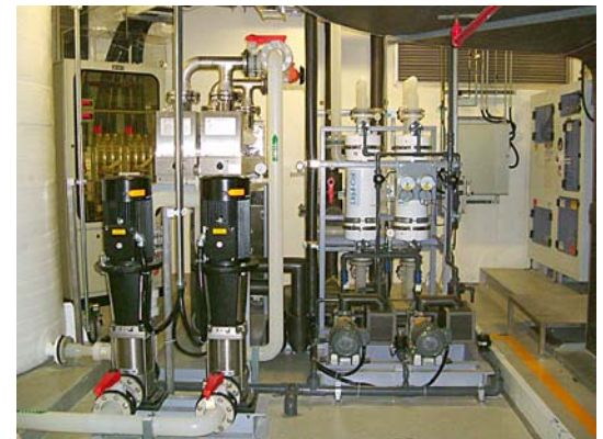
Second Stage Liqui-Cel Polishing System for CO 2 and O 2 Removal

This product is to be used only by persons familiar with its use. It must be maintained within the stated limitations. All sales are subject to Seller's terms and conditions. Purchaser assumes all responsibility for the suitability and fitness for use as well as for the protection of the environment and for health and safety involving this product. Seller reserves the right to modify this document without prior notice. Check with your representative to verify the latest update. To the best of our knowledge the information contained herein is accurate. However, neither Seller nor any of its affiliates assumes any liability whatsoever for the accuracy or completeness of the information contained herein. Final determination of the suitability of any material and whether there is any infringement of patents, trademarks, or copyrights is the sole responsibility of the user. Users of any substance should satisfy themselves by independent investigation that the material can be used safely. We may have described certain hazards, but we cannot guarantee that these are the only hazards that exist.