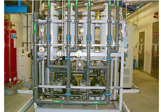
First Stage Liqui-Cel System for CO 2 and O 2 Removal

For more information on using Liqui-Cel Membrane Contactors in your application, please visit us on-line at www.liqui-cel.com or call us at the numbers listed below.